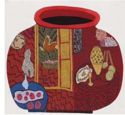
Jonas Wood Matisse Pot 7, 2016 acrylic, colored pencil and ink on paper 18 15/16 x 20 3/16 in. (48.101 x 51.276 cm) The Eli and Edythe L. Broad Collection