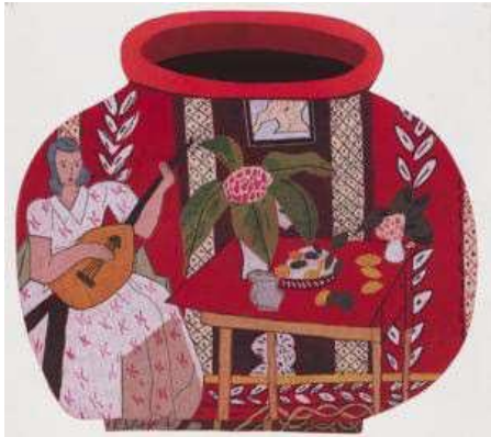
Jonas Wood Matisse Pot 8, 2016 acrylic, colored pencil and ink on paper 19 11/16 x 22 in. (50.006x 55.88 cm) The Eli and Edythe L. Broad Collection