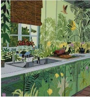
Jonas Wood Jungle Kitchen, 2017 oil and acrylic on canvas 100x 93 in. (254 x 236.22 cm) The Broad Art Foundation