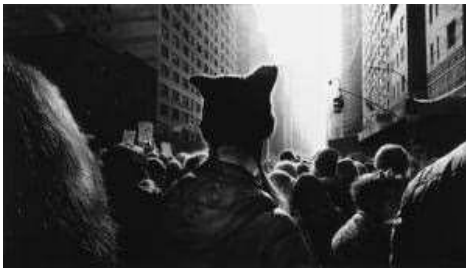
Robert Longo Untitled (Black Pussy Hat in Women's March), 2017 charcoal on mounted paper 66 3/4x 113 3/4 in. (169.545 x 288.925 cm) The Broad Art Foundation