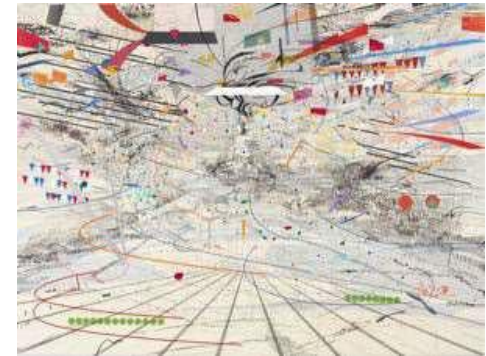
Julie Mehretu Congress, 2003 ink and acrylic on canvas 72 x 96 in. (182.88 x 243.84 cm) The Broad Art Foundation