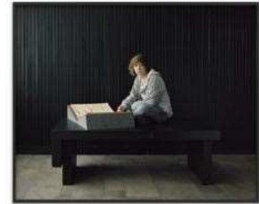
Sharon Lockhart Ola, "TODAY IN POLITICS," Our Review no. 167 (8863) , June 16, 1939, National Library of Poland, Warsaw, February 3, 2017, 2017 framed chromogenic print 63 1/2 x 79 in. (161.29 x 200.66 cm) The Broad Art Foundation