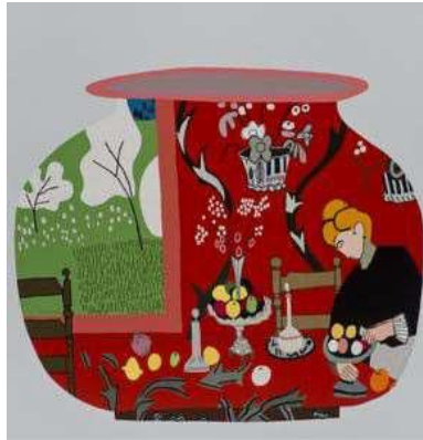
Jonas Wood Red Interior Pot, 2015 oil and acrylic on canvas 76 x 74 x 1 1/2 in. (193.04 x 187.96 x 3.81 cm) The Eli and Edythe L. Broad Collection