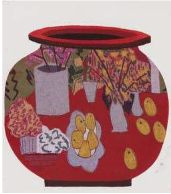
Jonas Wood Matisse Pot 5, 2016 acrylic, colored pencil and ink on paper 21 3/8x 19 1/8 in. (54.293x 48.578 cm) The Eli and Edythe L. Broad Collection