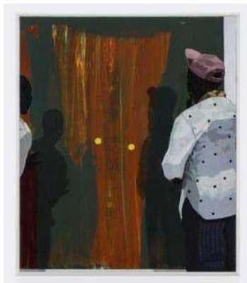
Kerry James Marshall Untitled, 2017 acrylic on PVC panel 28 x 23 3/8 in. (70.485 x 59.69 cm) The Eli and Edythe L. Broad Collection