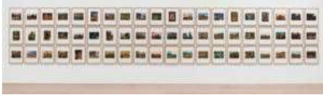
Sherrie Levine After Russell Lee: 1-60, 2016 giclee prints 20 x 16 in. (50.8x 40.64 cm) The Broad Art Foundation